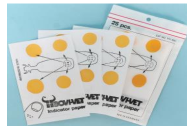
Figure: 3 Mastitis test Papers

pH test papers were used as mastitis detection over many years. It is quick and reliable mastitis detection test, as it is user friendly and cost effective method. It was no longer in use because it comes in a re-sealable pack of 25 papers and while testing if the drop of infected milk drops at the ph paper it will change the color of paper and it will be destroyed [7].