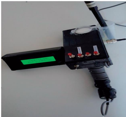
Figure: 1 The prototype of the portable device for measuring conductivity in milk.

Electrical conductivity of milk is a parameter usually used for identifying early sub-clinical mastitis and clinical mastitis in dairy cattle [5]. Measurement of electrical conductivity is a useful tool for monitoring somatic cell counts individually. EC is used to detect health status and detection of infected intramammary glands [14].