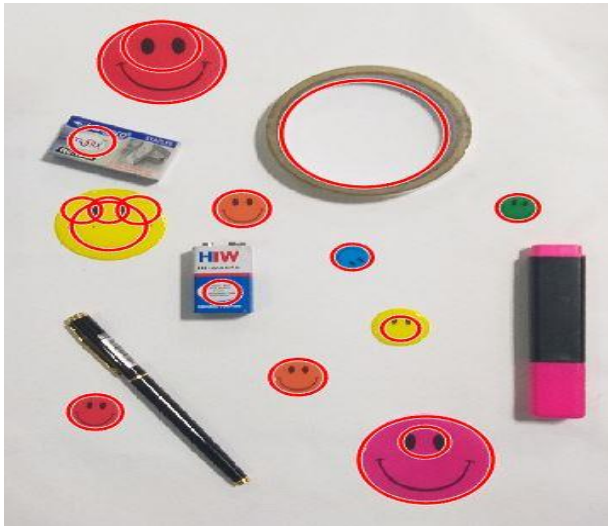
Fig. 4 . Detection of Circular Objects.