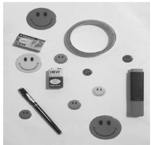
Fig. 3 . Image after conversion to grayscale.