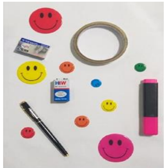
Fig. 2. Input cluttered image with different shaped objects

different shaped objects in image with very less time. The circular objects identified in figure 4 are of different radius. All the circular objects present in the image are detected with very less computational and storage time. The objects which are marked are identified as circular objects while the others are not identified as they are not circular. The part of the circular object is also identified in the non-circular objects as they contain the circular images. In this way all the circular images are identified and detected whether fully as a complete circle or partially on the non-circular objects. This proves the accuracy and efficiency of the algorithm being used.