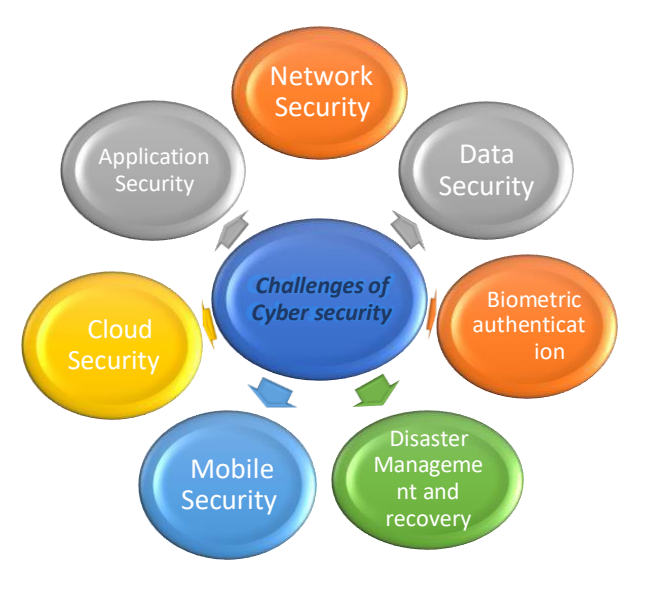
FIG 1: Challenges of Cybersecurity

To ensure security and safety over networks, the organisations face various challenges which are listed below. It is not only a challenge for organisation but also to individuals, political groups and terrorist organisations[2].